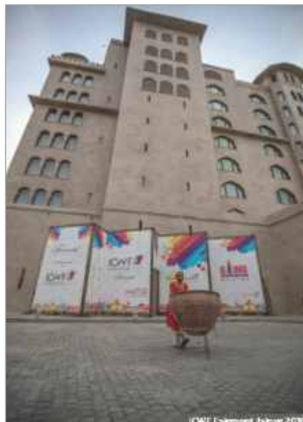
IISF Lucknow (India International Science Festival)

displays at any given time, no matter how big or small.” “There has also