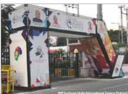
IISF Lucknow (India International Science Festival)