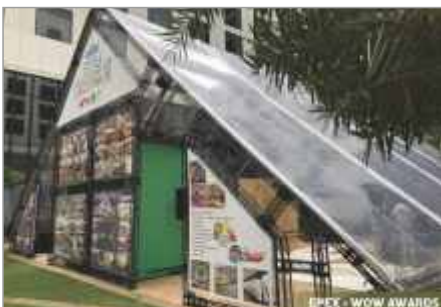
EPEX - WOW AWARDS