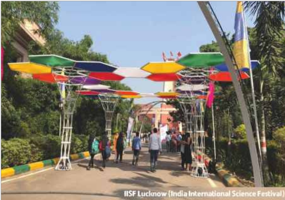
IISF Lucknow (India International Science Festival)

appealing system of display which boasts flexibility in design and configuration, making it the only display system in the country which offers the capability to create structures and displays of virtually any shape or size.