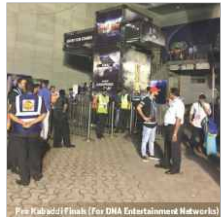
Pre Kabaddi Finals (For DNA Entertainment Networks)

sustainable display systems and an eco-friendly approach in the ever growing Exhibitions and Events Industry in India, The CubeX Truss, measuring only 5x5 inches is the size of today's smartphone, and is designed to assemble similar to how LEGO works, cutting down the assembly time by almost 45%. The re-configurable system has the potential to create small displays to large complex structures, from small backdrops & signages to gateway tunnels and complex structures, the