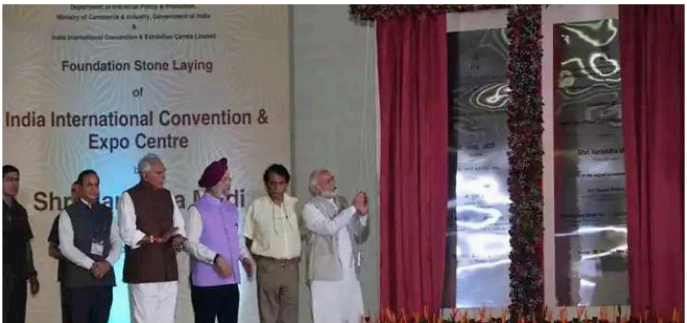
Prime Minister laying the foundation stone of IICC

Prime Minister Narendra Modi laid the foundation stone for the India International Convention and Expo Centre (IICC) at Dwarka Sector 25, New Delhi on 20th September, 2018. IICC will be biggest indoor exhibition space in India and also rank among the top 10 in the world.